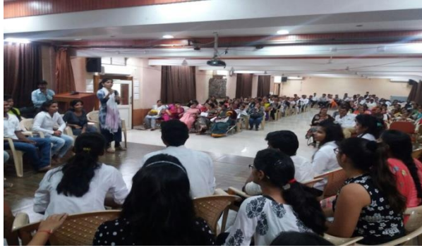
24 th September- NSS day celebration.