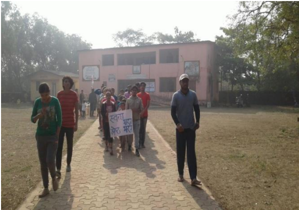
Rally on blood donation and HIV aids.