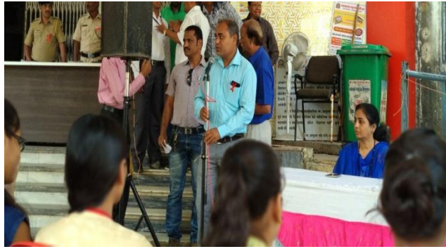
7 th December- session on nutrition.