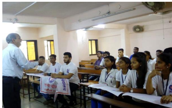
10 th and 11 th November –health and hygiene session at school.