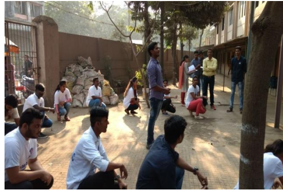
6 th january- street play on health hygiene.