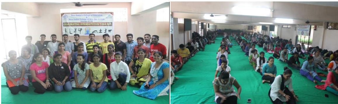
21 ST JUNE- International Yoga day.