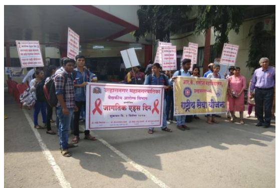
2 nd December- aids awareness program at UMC.