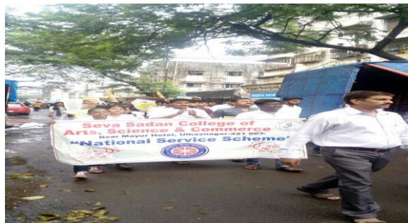
15 th September –rally on blood donation camp