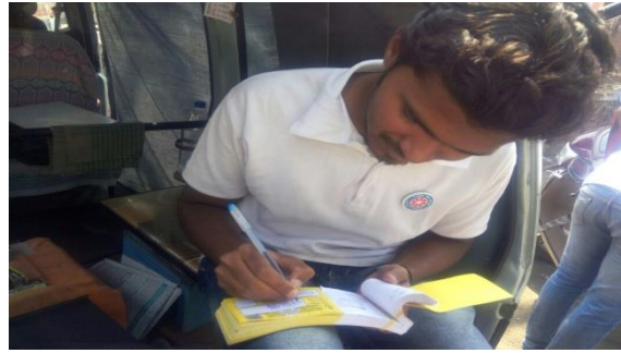
24 th October- PUC check up activity.