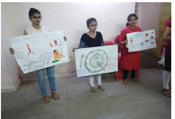
24 TH AUGUST- Poster Competition on Environment Enrichment