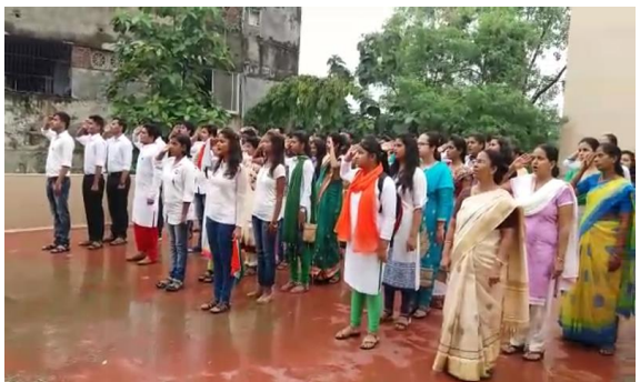
15 TH AUGUST- independence day.