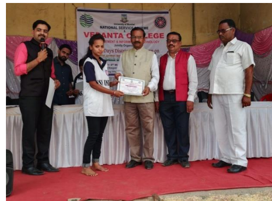
4 th march to 10 th march-district level camp at Naigaon shilpata,dombivali.