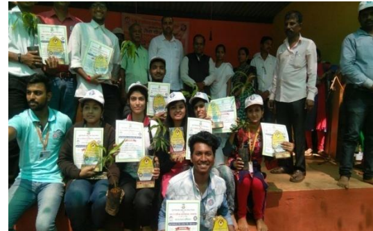
17 th feb to 21 st feb-state level camp at sindhdurg.