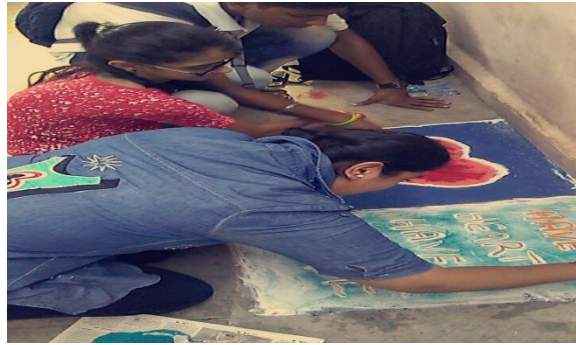
12 th September-rangoli competition on organ donation and HIV aids.