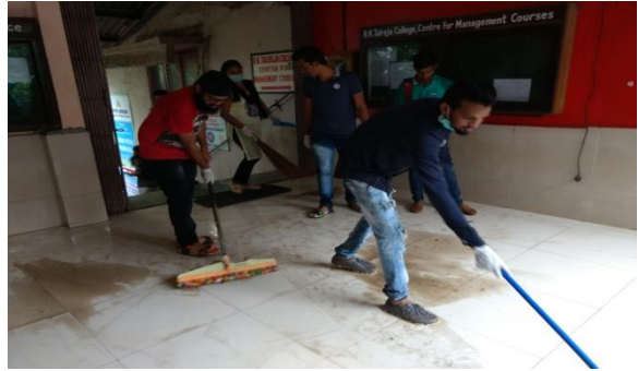
18 th JULY- swacchta abhiyan at college premises.