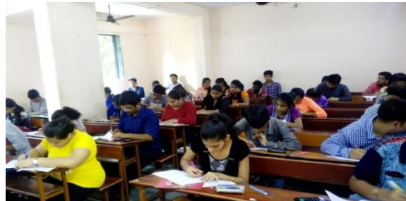
8 th august-essay competition.