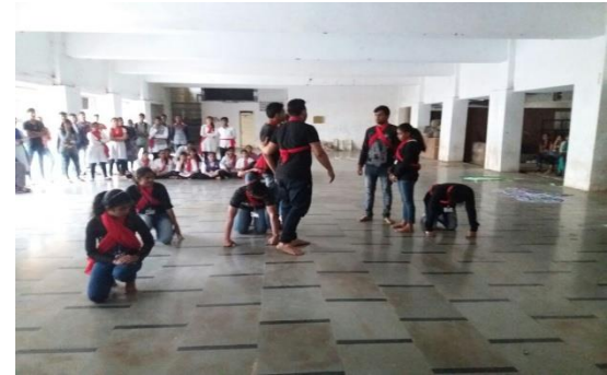
6 th December- street play at RKT college on aids awareness.