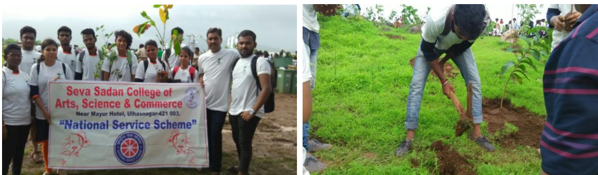
5 TH JULY – Mega tree plantation at Mangrool, Kalyan.