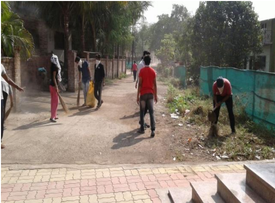
Swacchta abhiyan (cleaning activity) at village.