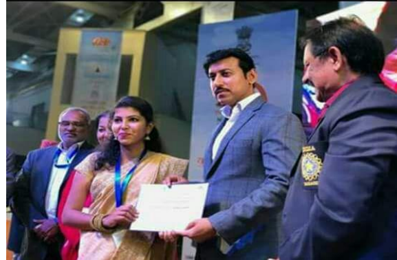
12 th jan to 16 th jan- national youth festival at greater noida.