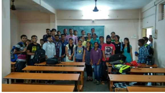
18 TH JULY- university foundation day.