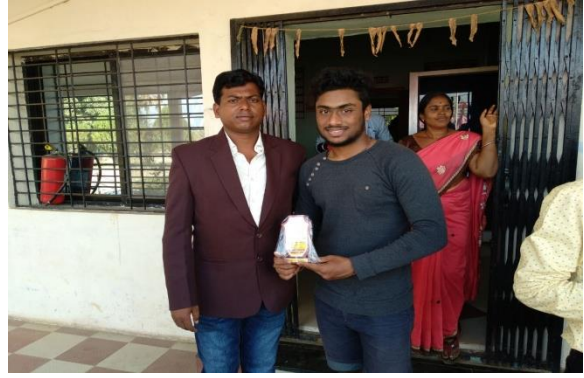
29 th jan to 4 th feb- state level camp at chandrapur,gadchiroli.