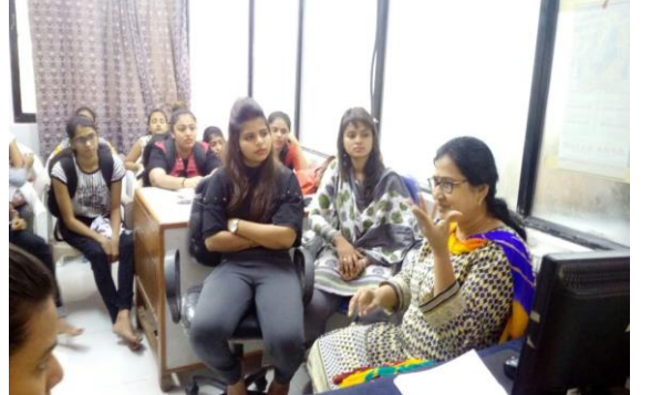
16 th October- session on adolescence and reproductive education.