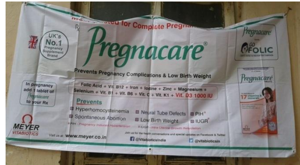
12 th august- session on pregnacare (reproductive) at CHM college.