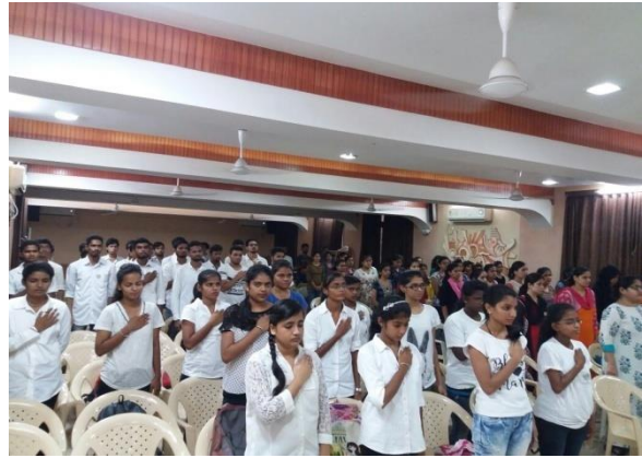
14 th October- NSS orientation program.