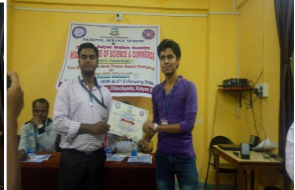
5 th and 6 th february-swachta session at model college, kalyan.