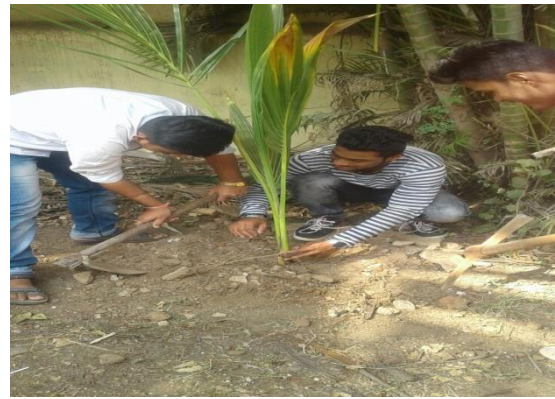
18 th November- tree plantation at central hospital.