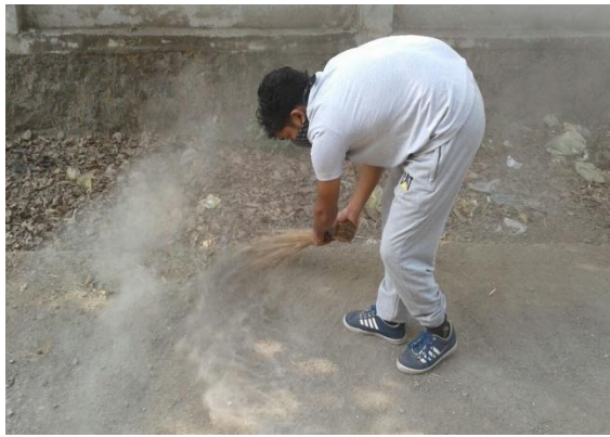
Ground cleaning activity.