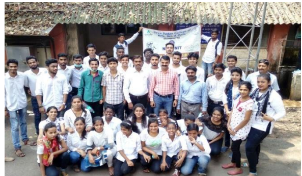
28 th September- swachta abhiyan at central police station.