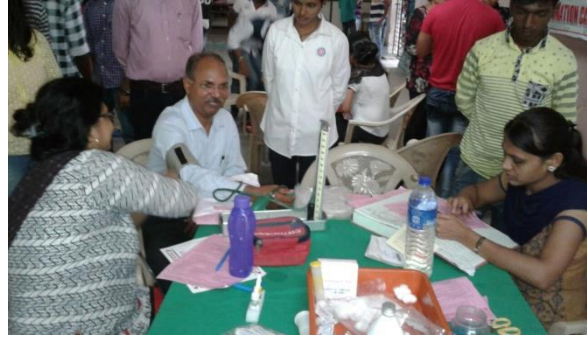
14 th November- hepatitis –b vaccination.