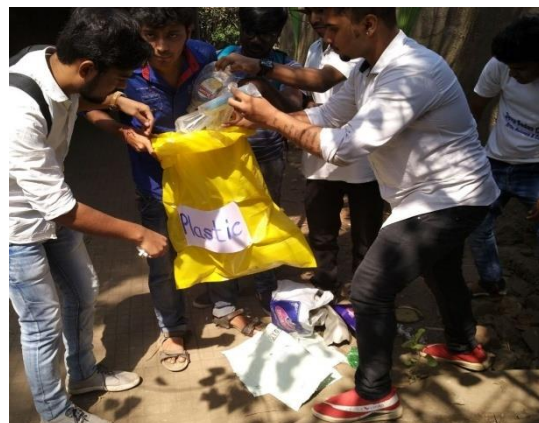
12 th december-environment saintation and disposal of garbage.