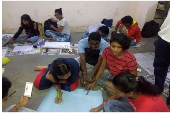
12 th AUGUST- poster competition on HIV Aids.