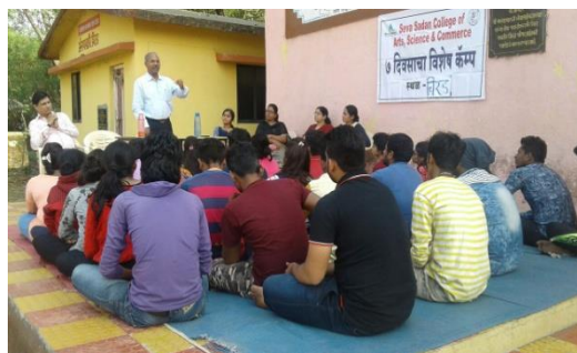
Session by principal sir