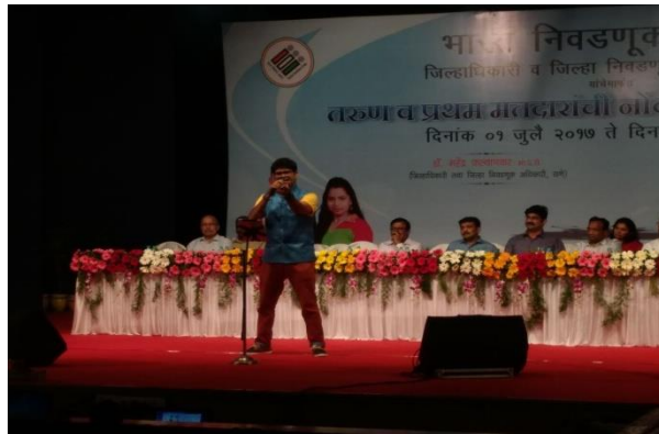
30 th july-voter's id activity at thane.