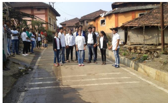
9 th december- street play on waste management.