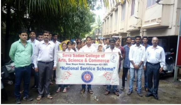
12 th October-rally on road safety.