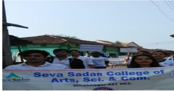
6 th November-announcement for medical check up camp.