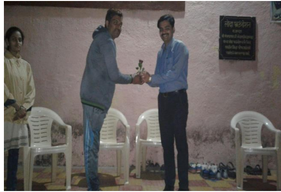
Session by prashant sir.