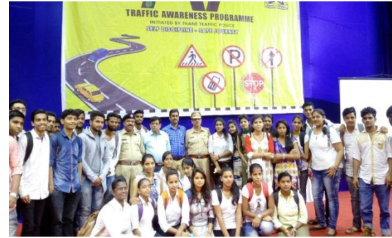
27 th September-traffic police awareness program (TAP) at town hall.