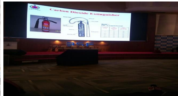
24 th january- fire safety awareness at bombay stock exchange.